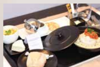
Sample evening meal: