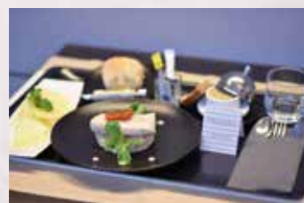
Sample lunch in ambulatory care:

Together with the Medirest team, trained by my staff several times a year, we create Terroir Parisien dishes that are seasonal, gourmet, audacious, well-balanced, and approved by the Hospital's dieticians. Our dishes are served to hospitalized patients every evening, and at lunchtime to ambulatory patients. Guests may also enjoy Terroir Parisien options at the Hospital's restaurant.