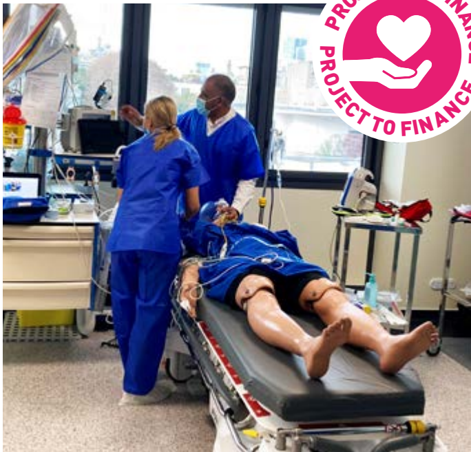
Training of emergency doctors in West Africa

In response to this major public health issue, the American Hospital of Paris aims to set an example by launching an ambitious continuing training program for its allied health professionals and administrative staff. The goal is to optimize the delivery of care in the first ten minutes following a cardiorespiratory arrest, and thereby save lives. This program is based on the Advanced Cardiac Life Support (ACLS) program, the leading international first aid certification course. Three training sessions have already been scheduled for the first semester of 2023, to be attended by approximately 60 employees. The two-day simulation-based sessions enable participants to practice on a web-enabled manikin in order to acquire essential resuscitation skills.